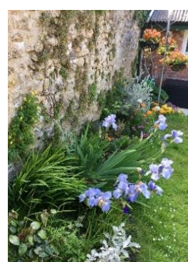
A perfect venue for outdoor and indoor events

A newcomer to It's Your Neighbourhood, The Speedwell is a Grade 11 listed property in Abbey Street that was left in trust in 1923 to provide a club for the use and benefit of girls around Crewkerne. Today, it is available to the whole community and the gardens are receiving tender loving care.