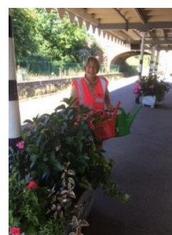
The station always looks colourful and well cared-for

The Friends of Crewkerne Station have for long been keeping the platforms tidy and colourful throughout the year and this is the latest in their cache of awards. As well as RHS success, the enthusiastic small group have achieved many triumphs in contests run by the Blackmore Vale Line Community Rail Partnership. This group photo may come as a surprise – you'll usually see the volunteers in their working tabard or dressed as festive elves!