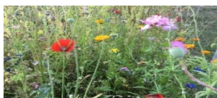
A colourful landmark on the eastern edge of town

This Grade 11 listed Pillbox on the A30, was probably built in autumn 1940 as part of a defensive line in the Second World War. It was uncovered a few years ago and John and a small group got together, imaginatively planting the sloping site with glorious natural displays and spring bulbs. Now with a seat, it has been transformed into an unexpected haven.