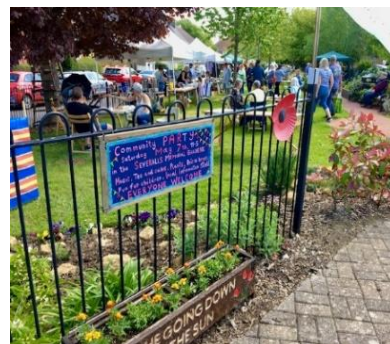
May Garden Party

The Severalls War Memorial Garden is a wonderful place to spend a reflective moment. It is approached by an impressive avenue of horse chestnut trees planted after the First World War, with one tree for each man from Crewkerne who lost their life. An enthusiastic group of volunteers take care of the Garden which is enjoyed by all ages. Community creativity is actively encouraged in this unique area.