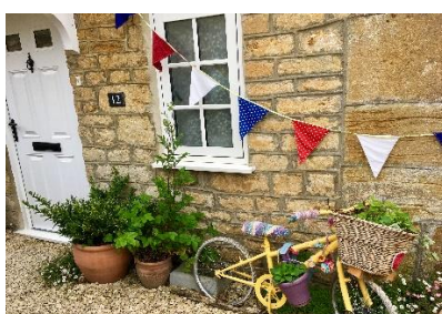
Bunting for this bike