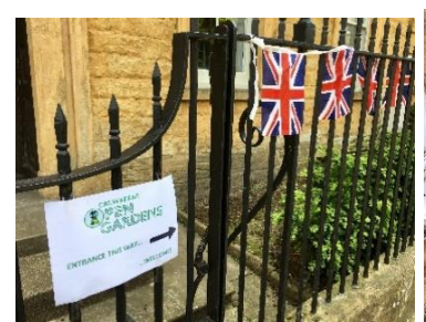
Gardens open for Jubilee