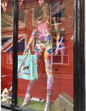
Oscar's blooming lady