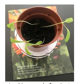
Looking good after just 12 days