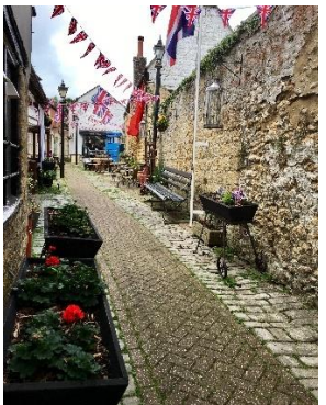
The lane at Oscar's