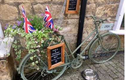
New look for Grand Interiors' bike